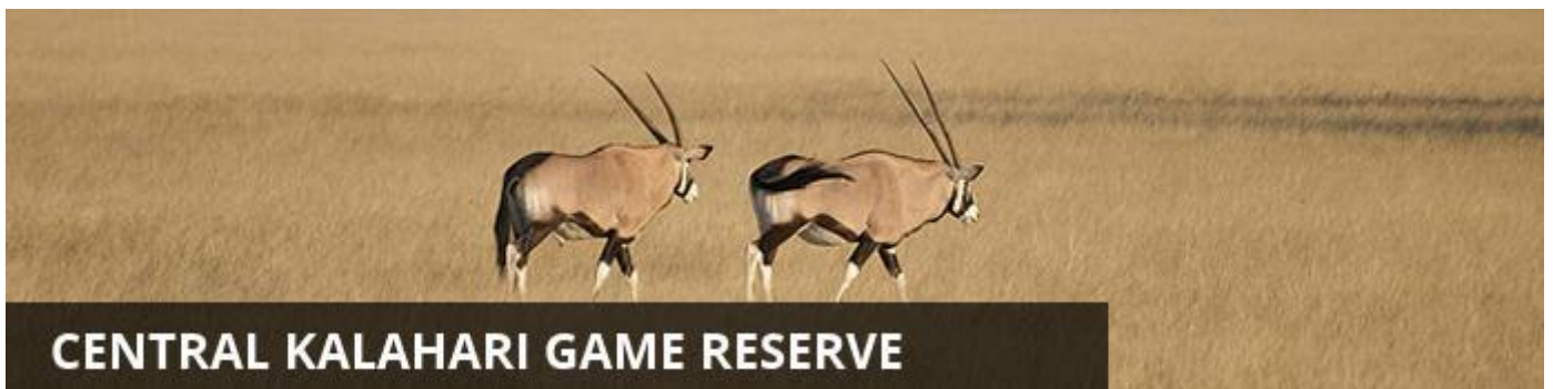
CENTRAL KALAHARI GAME RESERVE